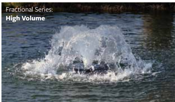
Fractional Series: High Volume