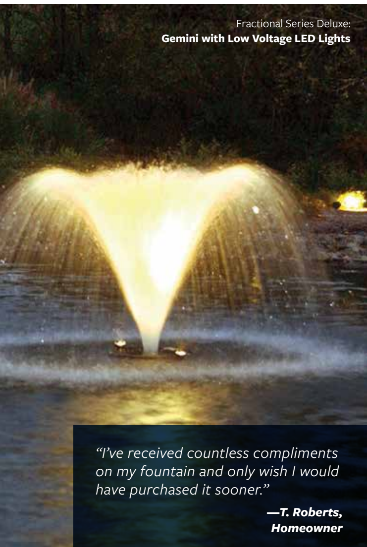
Fractional Series Deluxe: Gemini with Low Voltage LED Lights

“I’ve received countless compliments on my fountain and only wish I would have purchased it sooner.”