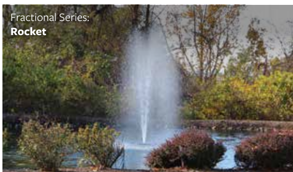
Fractional Series: Rocket

*Only available in the continental U.S.A.